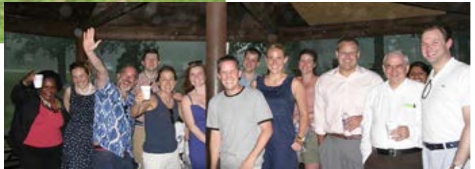
The board members of the Foundation and the Bar Association board got very close during the storm which lasted about 25 minutes and brought rain, lightning, and high wind.