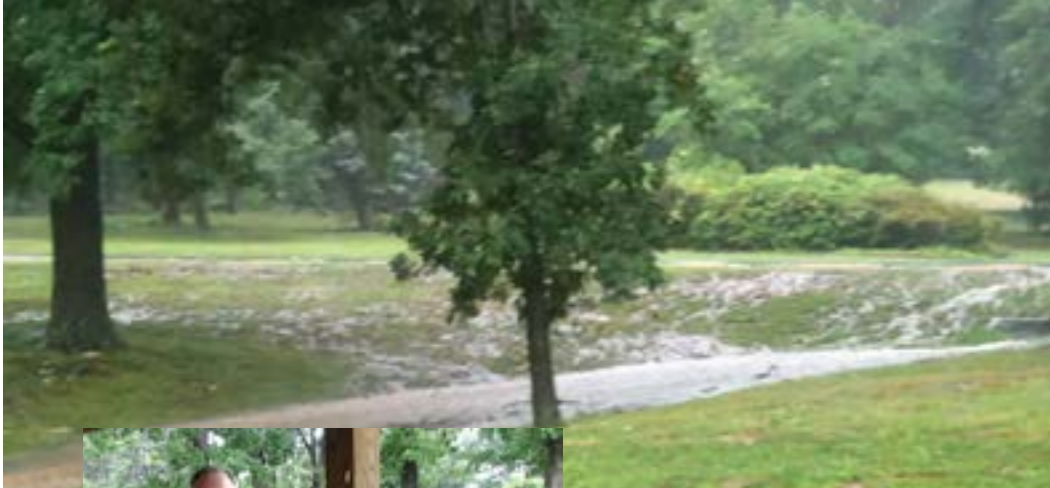
The waters in Fort Ward Park rose around the picnic pavilion on all sides.