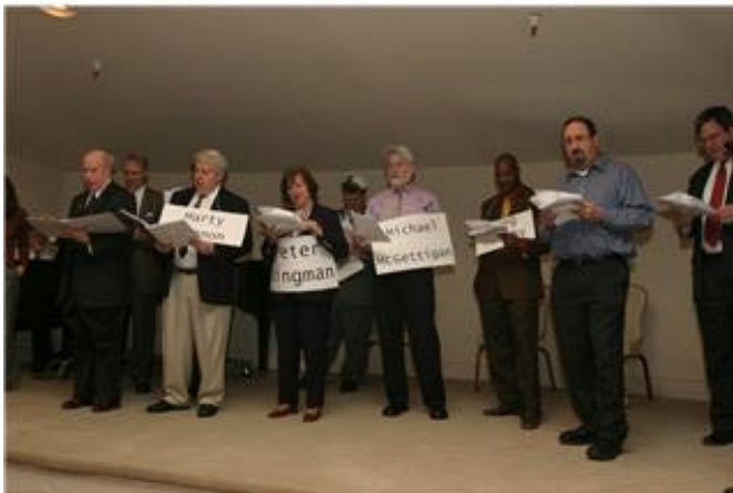
Cast (left and below) bursting into song